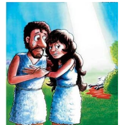
ATONEMENT —According to the Plan of Redemption, the animals' deaths would represent Adam & Eve's deaths.

Notice some things we learn from animal sacrifice: